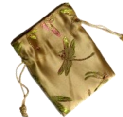
Small money bag