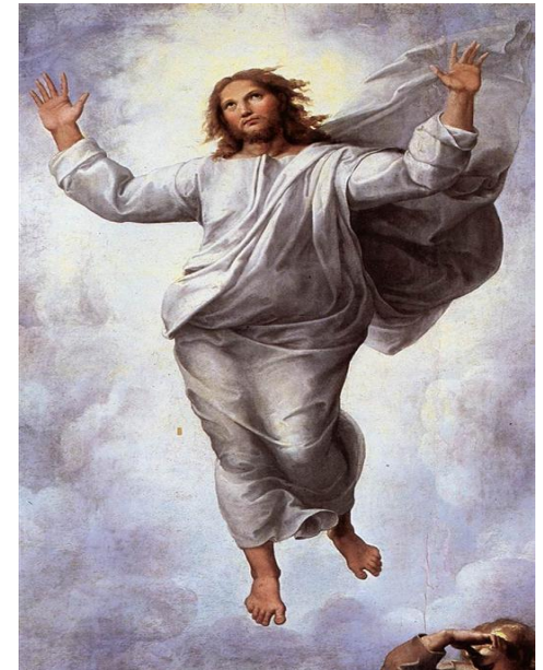
The Transfiguration, Raphael 1520

Celebrant & Preacher: The Revd Will Newman